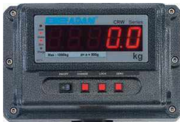
Front Fascia Panel

Our Crane Scales are rugged and dependable. The internal rechargeable battery means that they can be operated for up to 150 hours before recharging.